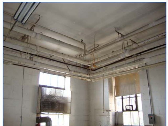
Interior View of former hospital / nursing home building