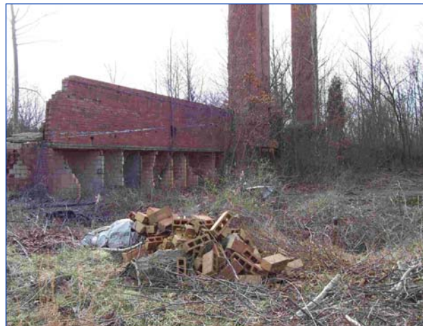
Above Photo shows part of Brickyard prior to cleanup; Photo below shows ribbon cutting ceremony at completion of cleanup.

Several entities have approached the Village about purchasing the property, which, according to Mayor Paul Turman, is now "officially for sale". Barboursville applied for and received a $200,000 EPA Brownfields Cleanup grant in 2007 to remediate the property, and the WVDEP provided additional funding to complete environmental assessment activities prior to initiation of cleanup objectives.