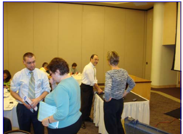
Participants take a well-deserved break and interact during NDC’s fast-paced Brownfields Financing Workshop

The WV Brownfields Assistance Center at Marshall University (WVBAC), in conjunction with the Northern Brownfield Assistance center at West Virginia University and BB&T Bank, co-sponsored a one-day Brownfields Financing training workshop, held in Beckley and Morgantown, WV. The training was conducted by National Development Council’s Training Division. The Beckley workshop took place at the Tamarack Conference Center, and was attended by approximately 20 individuals from various backgrounds, including economic development, environmental regulatory, legal council and academia. Attendees received focused information and first-hand knowledge on financing brownfields. The event was fast paced and well received by participants, with extensive exercises and detailed case studies. The WVBAC extends a special thanks to BB&T Bank for their partnership on this event, and their continued support, involvement and dedication to brownfields redevelopment in West Virginia.