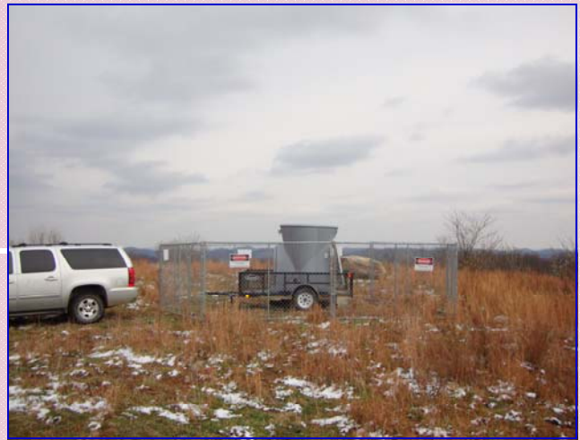
Wind speed, wind direction and associated data being collected on former surface mine site in southern West Virginia

The West Virginia Brownfields Assistance Center at Marshall University (WVBAC), within Marshall University's Center for Environmental, Geotechnical and Applied Sciences (CEGAS), participated in the yearly West Virginia Wind Working Group Conference, held October 19th at Canaan Valley Resort and Conference Center. CEGAS staff presented initial findings from a recent Sonic Ranging and Detection (SODAR) data collection study performed at the ICG Eastern LLC surface mine complex, located near Cowen in Webster County. This study was conducted to perform initial screening and wind resource data collection to assess wind development opportunities on this extensive surface mine site. A full report has been compiled for the West Virginia Division of Energy. Additional surface mine sites are currently under various stages of evaluation.