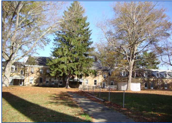
Exterior View of former Morris Memorial Hospital facility

The bustling town of Milton, located in eastern Cabell County, WV is owner of a gently rolling, picturesque 180-acre plot of land, located on U.S. Route 60, near I-64 and the eastern border of the town. This site was first home to the Morris Memorial Hospital for Crippled Children in the 1930's. The main focus of the hospi-