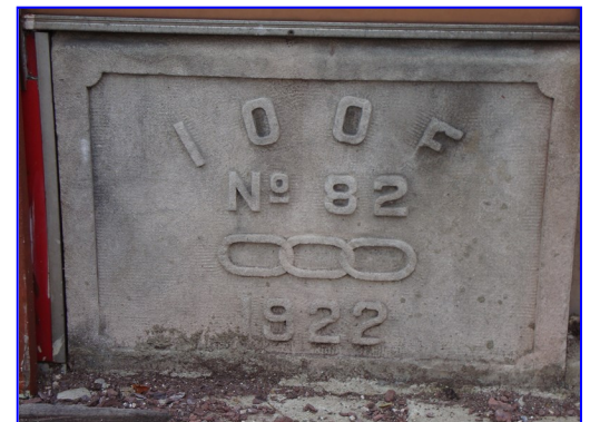
Cornerstone of Former Independent Order Of Odd Fellows Lodge #82 Building