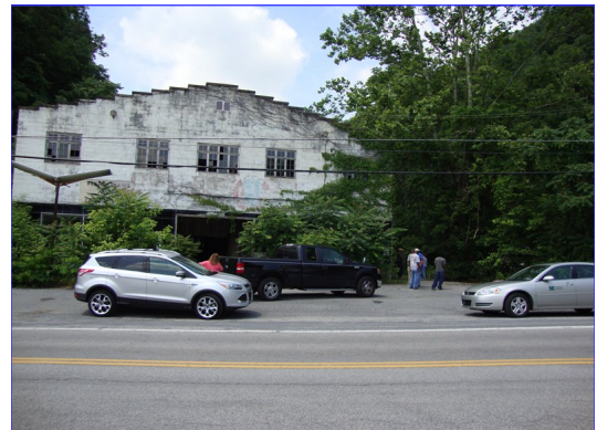
Top: View of Former Service Station

The Solution? The WVDEP's current EPA Brownfields petroleum grant. Based on an extensive review of courthouse records, no responsible party has been identified. The WVBAC and WVDEP have been working closely with the property owner and the Summers County Commission, with an overall goal of assessing the property for petroleum impacts to spur economic redevelopment. Using funding from their EPA Brownfields Petroleum Assessment grant, the WVDEP and the WVBAC, acting grant administrator, are finalizing plans for an assessment of the former service station property, which will include removal of underground storage tanks. The project was approved by EPA Region III Brownfields Program in August, 2013. Field work is scheduled to start in September.