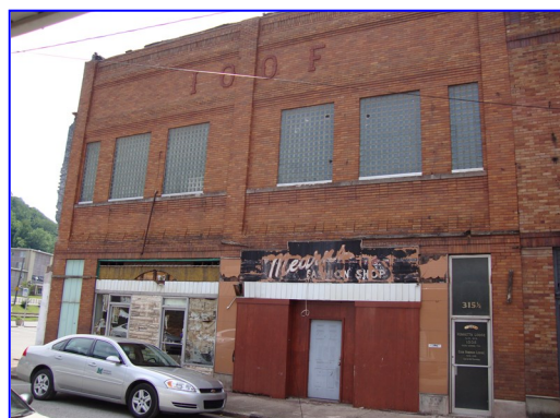
Former Independent Order Of Odd Fellows Henrietta Lodge #82 Building