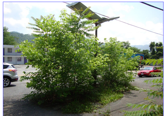
Bottom: Remnants of Former Pump Island