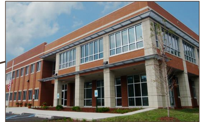
USDA/GSA Sabraton Professional Building